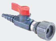
1. Pure water outlet valve