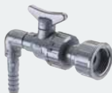
2. Pure water outlet valve