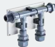
4. Pure water distributor block