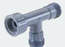
5. Pure water T-connector